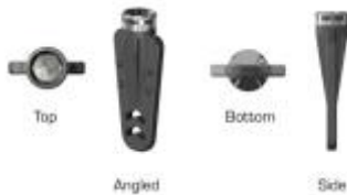
Figure 2: Implant Lengths